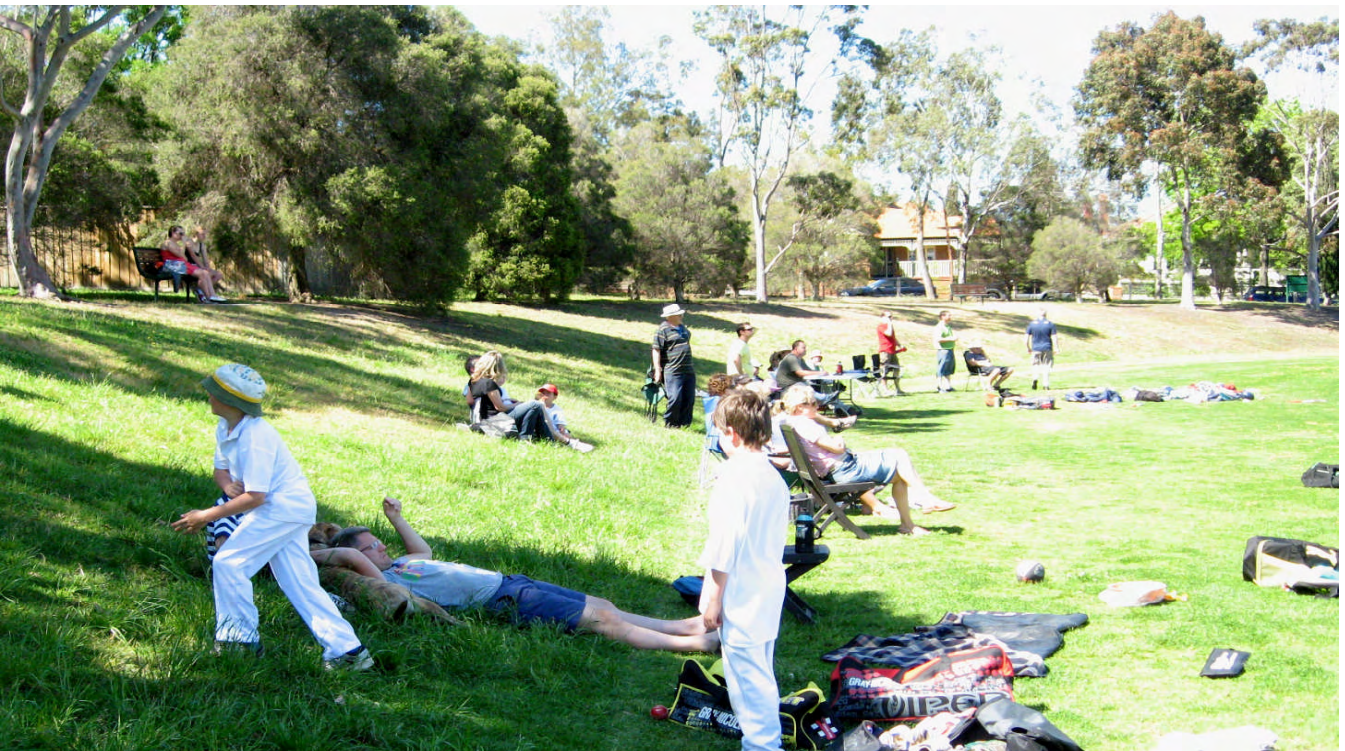
And The Members