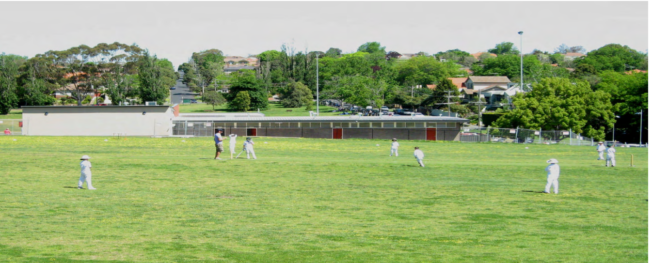
Action From The Main Oval